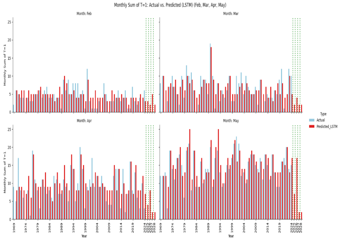
Figure 2: Monthly Trend of T=1, for Months February, March, April, May, since 1969 to 2026 with Predicted Trend till 2028.